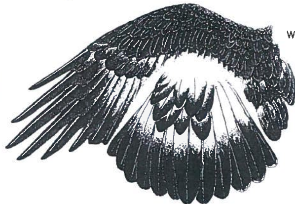
IMMATURE GOLDEN EAGLE