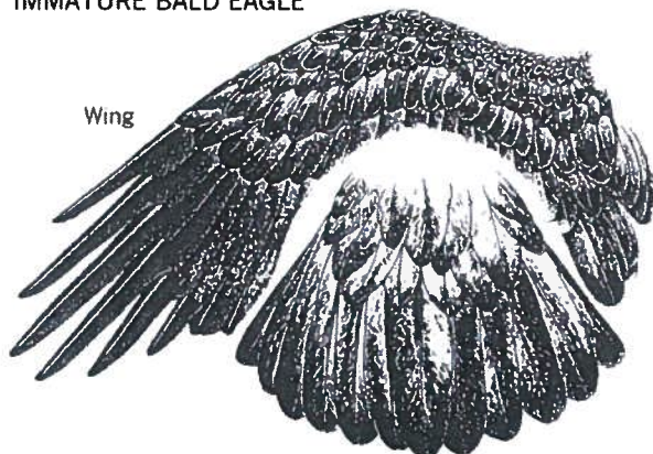
IMMATURE BALD EAGLE