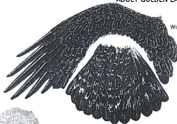
ADULT GOLDEN EAGLE