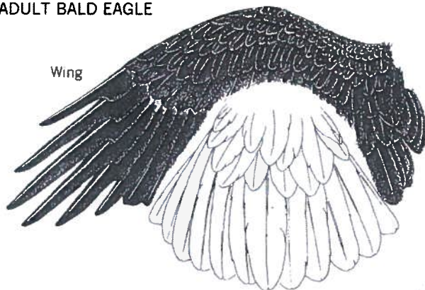
ADULT BALD EAGLE